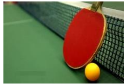
Table-tennis Yr 7 and 8 (TB)