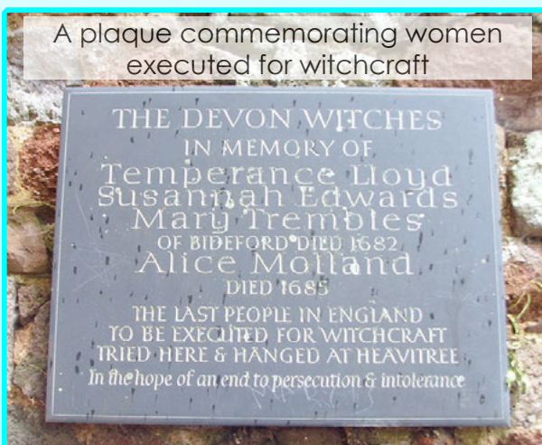
A plaque commemorating women executed for witchcraft

The rich people of the time carried their wealth around with them as there were very few banks during this period. This made them easy targets when they were travelling on unguarded roads. Because the country as a whole was getting richer, poorer people could afford horses and it was easy to set up a profitable, but risky, business as a highwayman. This involved holding people up, often at gunpoint, and demanding they hand over their money, jewels and any other riches.