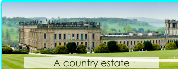
A country estate

In the early modern period (1600-1800), England became a richer country, mainly based on the wealth it gained from the slave trade. Some people became very well off indeed, as you can tell from the fine houses and parks they built, which you can still see in our towns and countryside today.