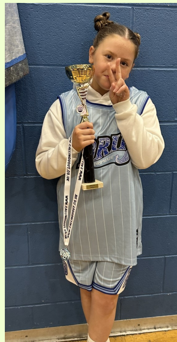
Haven's team Calypso placed 3rd..!!! at the 'Calling You Out' competition last weekend .